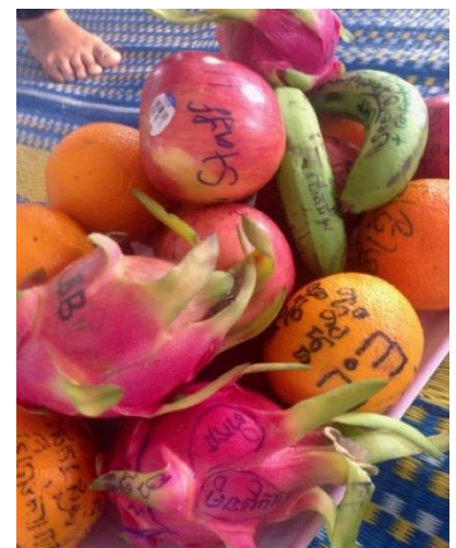
Cambodian fruit with words.

Each new group comes together with a different purpose, so it is always important to make a judgment about which materials to introduce and what people will do with them. A couple of years before our Taiwan trip, Alice had worked in Cambodia with about 45 people for a non-government organisation (NGO) called Epic Arts . The collective aim was very concrete and practical: to come up with a three-year strategic plan. The group encompassed all strata of the organisation (directors, artists, caretakers etc.) and a range of departments (e.g. education, buildings, performance). Readily available materials included teapots,