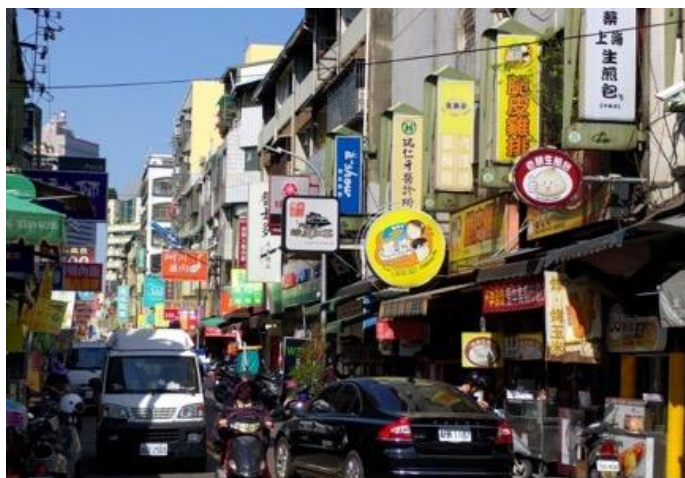
Street scene in Taichung.

On our first day in Taichung, we walked from our high-rise hotel to the museum to see where we would soon be working. On the way we took in the urban atmosphere of the city with its colourful signs and Chinese characters, and the swarms of motor scooters. When we reached the museum, the contrast was striking: we found ourselves in a calm and spacious modern building surrounded by green space. A member of staff showed us round and took us to the gallery in which we would be