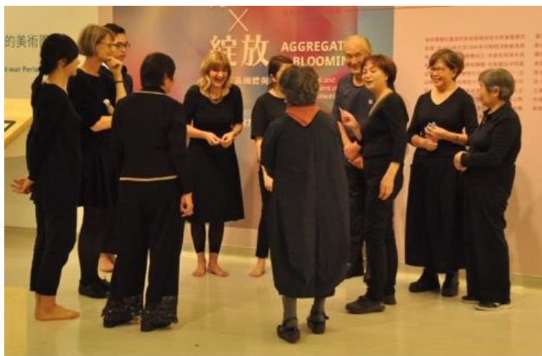
Minutes before the live performance.

We didn't (couldn't!) edit the poem at all but as a piece of writing it was rather lovely. Though some bits sounded sentimental to my ears, others seemed profound (possibly Taoist or Buddhist inspired – for example: "If you have everything you have nothing. If you have nothing you have everything. Everything is nothing, and nothing is everything.")