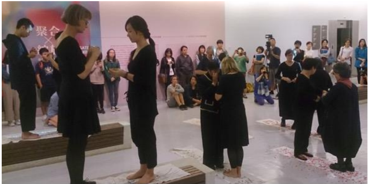
Passing ice during the live performance.

Excitement grew as we watched the audience arrive. Alice then brought us into the performance space one pair at a time. Some performed their duets on top of the benches, while others stayed on the ground, thus creating a two-level spectacle for the audience. The 10-minute performance was professionally filmed and later edited for sharing on the web.