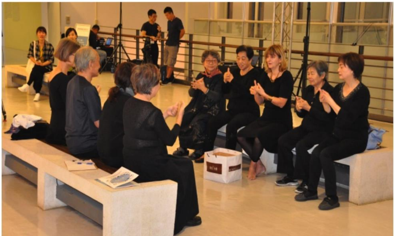
Practising hand movements.